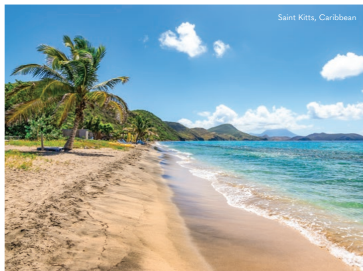
Saint Kitts, Caribbean

Dates not mentioned are spent relaxing at sea