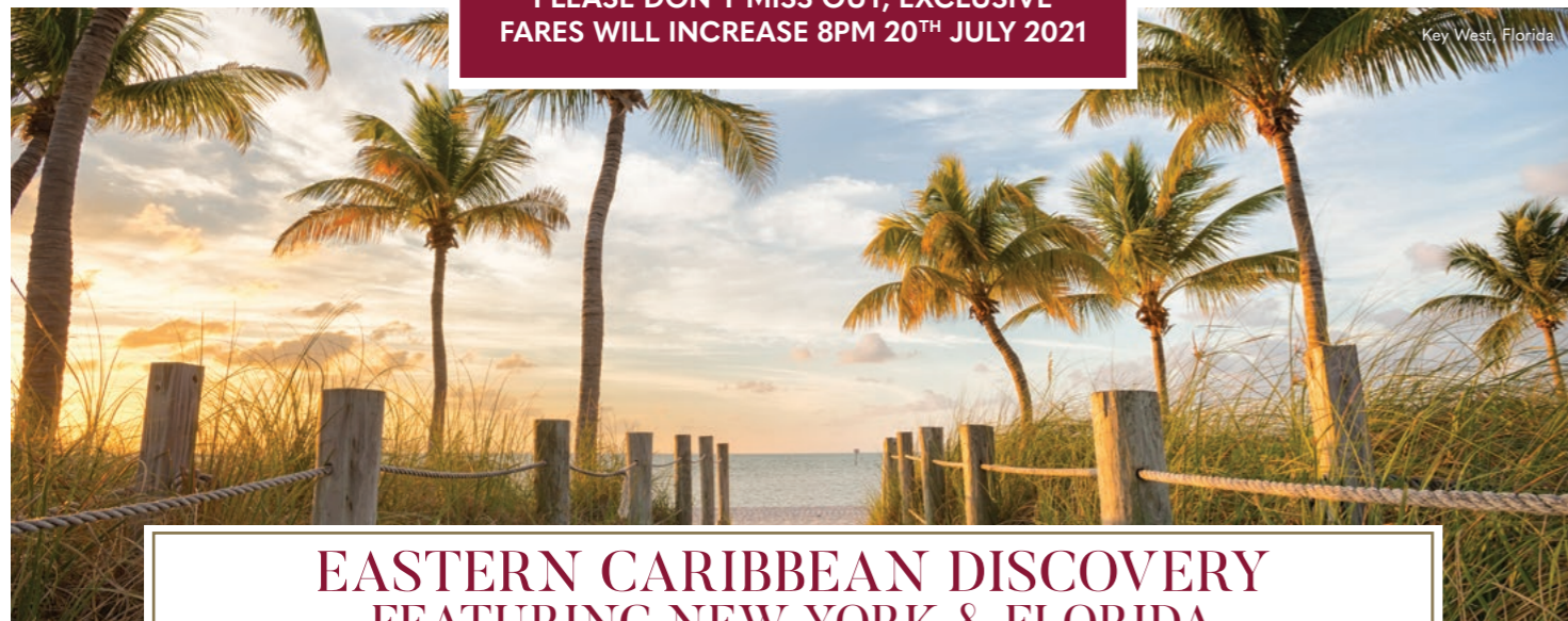
Key West, Florida

PLEASE DON'T MISS OUT, EXCLUSIVE FARES WILL INCREASE 8PM 20 TH JULY 2021