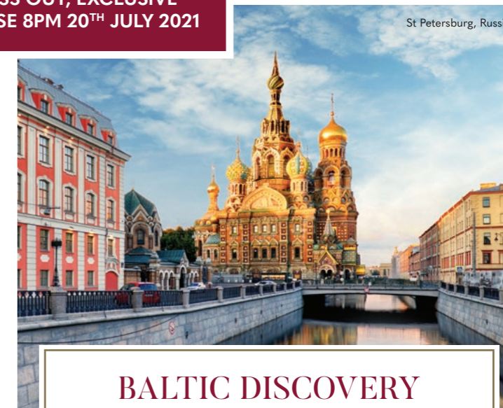
St Petersburg, Russia

BOOK TODAY & EARN UP TO £77 OFF YOUR NEXT BOOKING ††